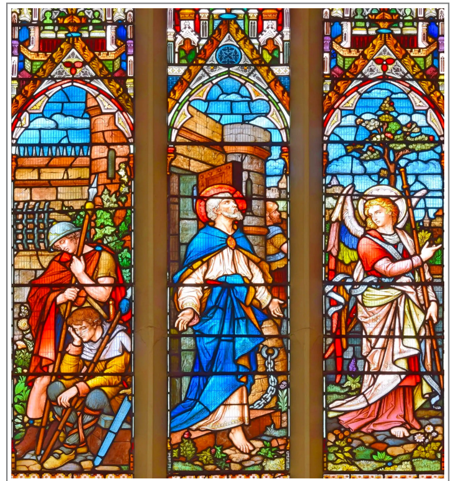
window based on Acts 12, from St Peter's Church, Roath the oldest Roman Catholic church in Cardiff, capital of Wales