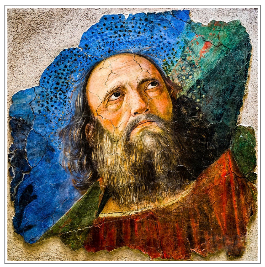
The Apostle Paul by Melozzo da Forti fragment of a larger Italian fresco image