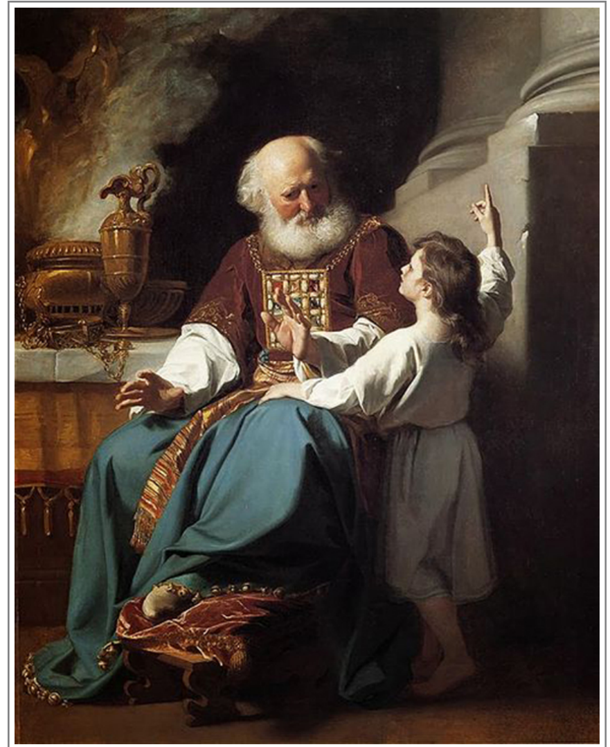
Samuel Relating to Eli the Judgments of God upon Eli's House John Singleton Copley (1738-1815)

Neither the hair shirt nor the soft berth will do. The place God calls you to is the place where your deep gladness and the world's deep hunger meet.